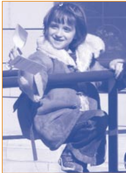
Lower School students played with their new toys—small shovels that carried a big message.